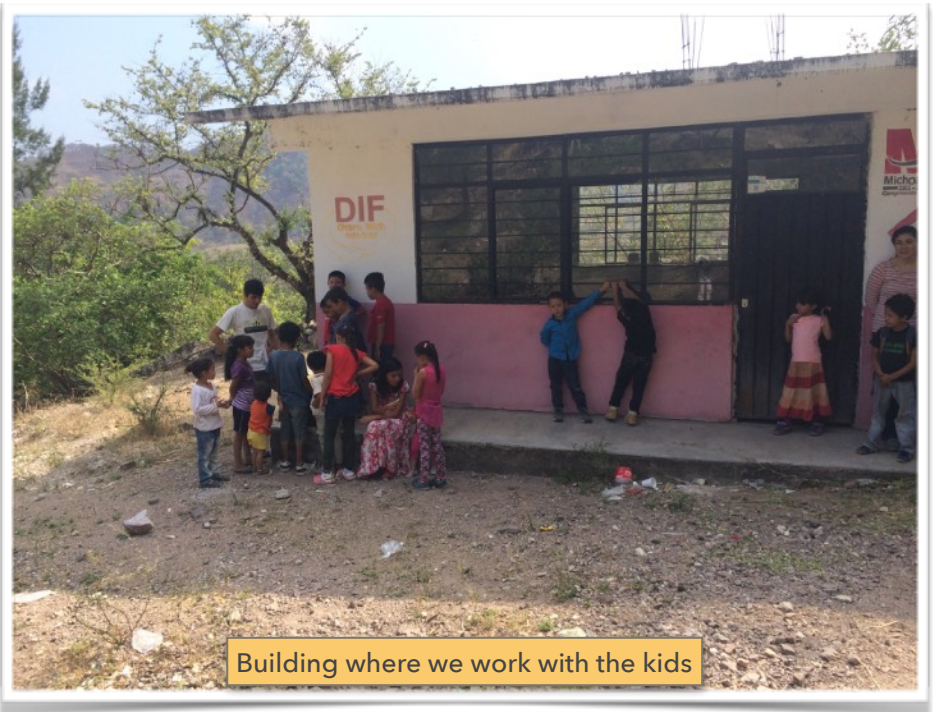
Building where we work with the kids