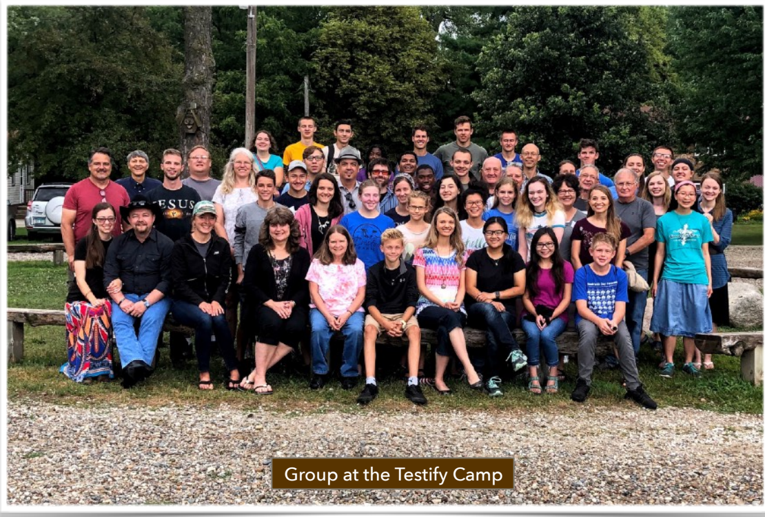
Group at the Testify Camp