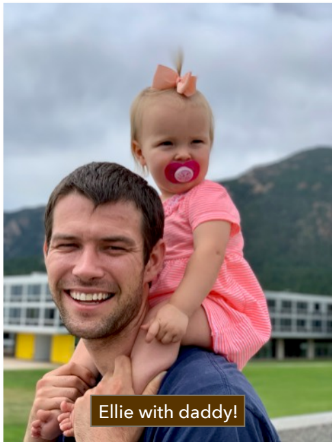
Ellie with daddy!