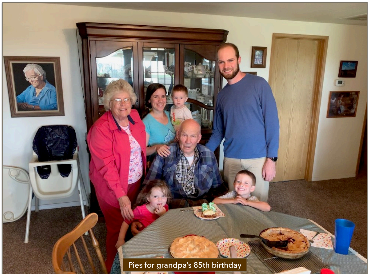
Pies for grandpa's 85th birthday

Lord willing I'll be flying home on Monday night, the 2nd of September.