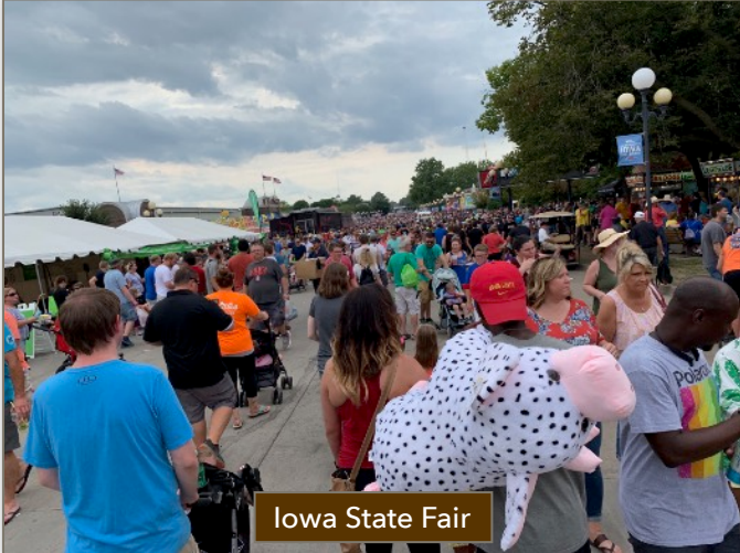
Iowa State Fair