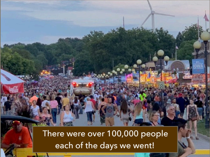
There were over 100,000 people each of the days we went!