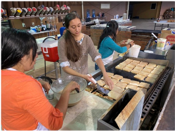
During this week long outreach we had a great team in the kitchen working around the clock to make breakfast, lunch and supper for the 100 plus people participating.