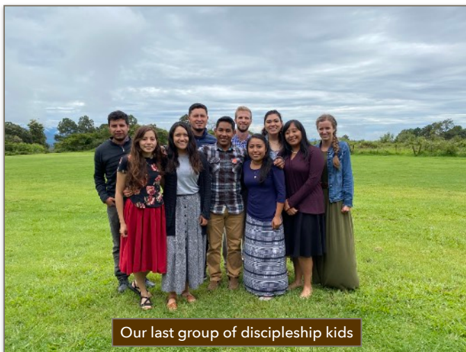
Our last group of discipleship kids