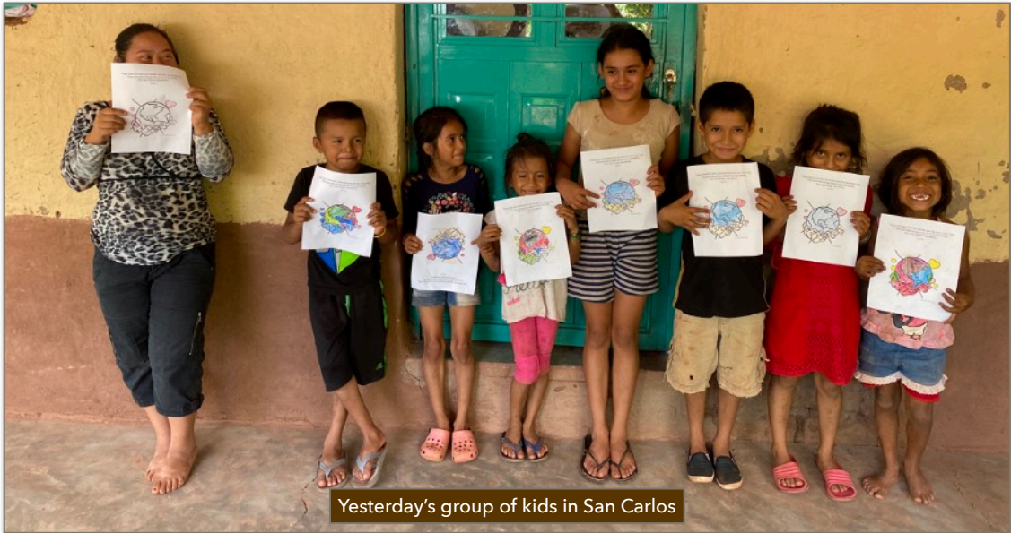
Yesterday's group of kids in San Carlos