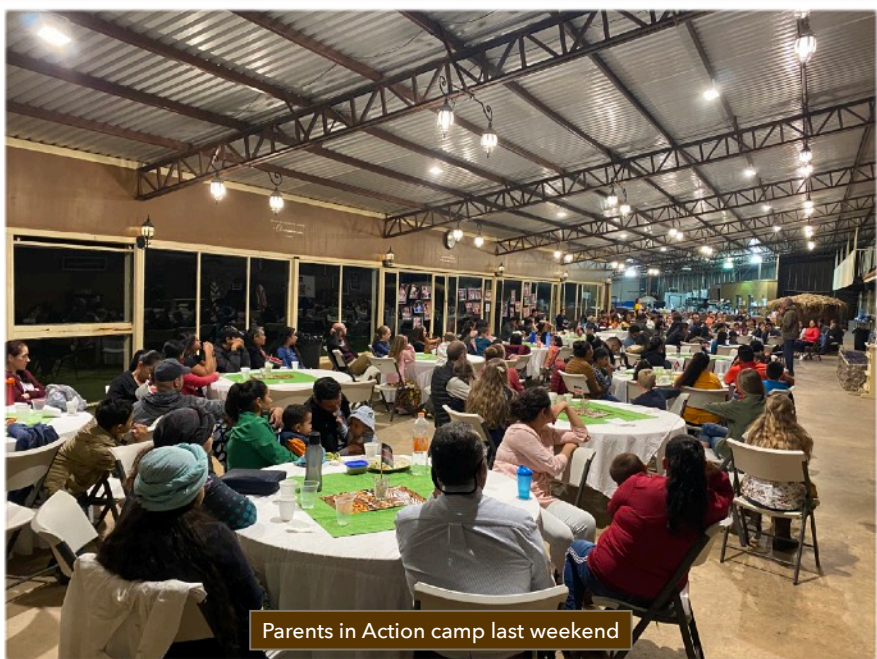
Parents in Action camp last weekend