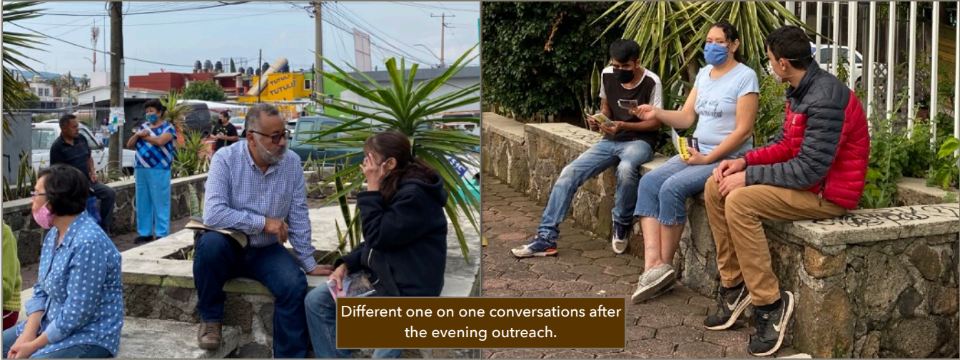
Different one on one conversations after the evening outreach.