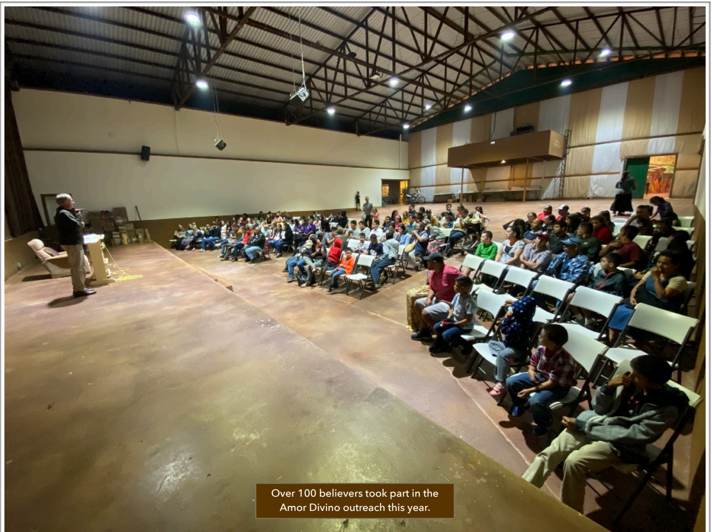
Over 100 believers took part in the Amor Divino outreach this year.

In all our Amor Divino outreaches we have never had such a good response. Praise the Lord!