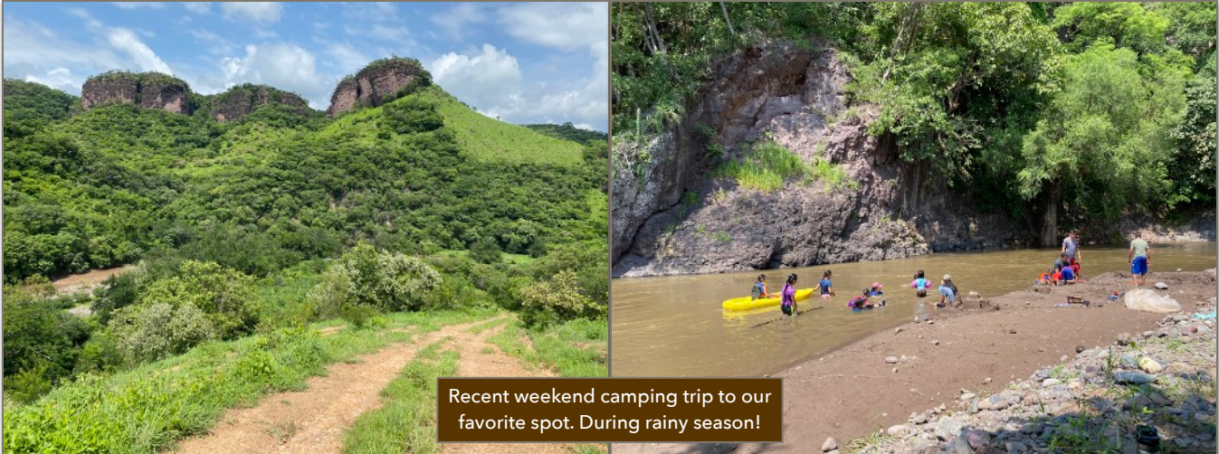
Recent weekend camping trip to our favorite spot. During rainy season!