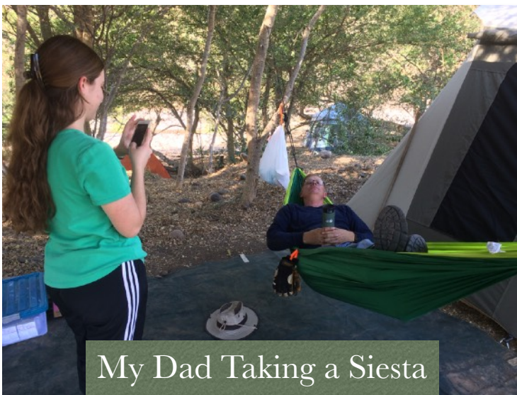
My Dad Taking a Siesta

We do this camping trip once a year, and drive a little over an hour down from the camp to what is called hot country. It is very