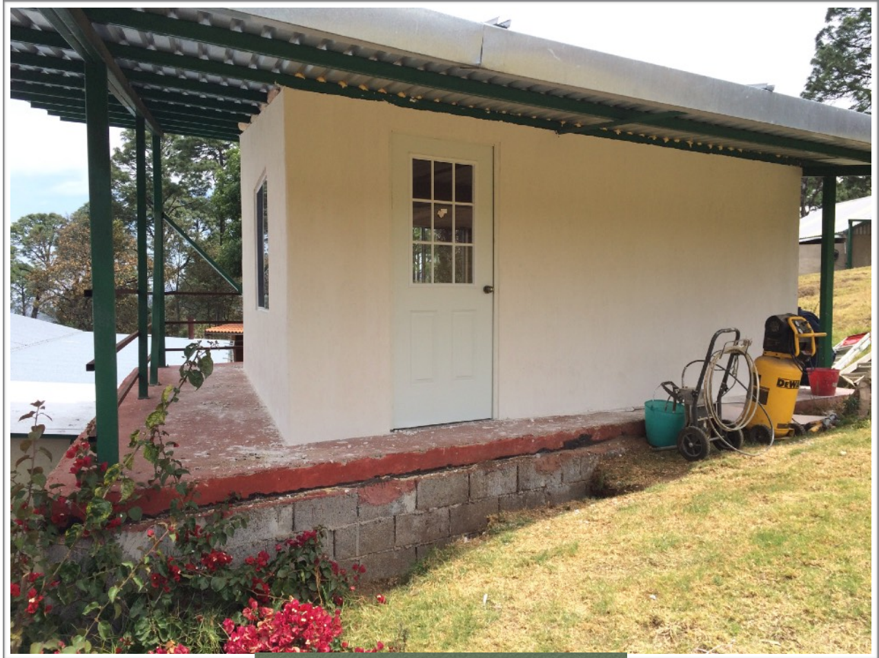
Recording Studio Outside

Praise the Lord we are pretty much ready to start recording! He has graciously provided the equipment that we have needed and continues to provide! I'm excited about getting started and I'll let you know in future updates what is being produced, and where you can find it available.