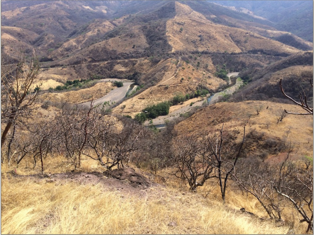
View from Above Camping Site