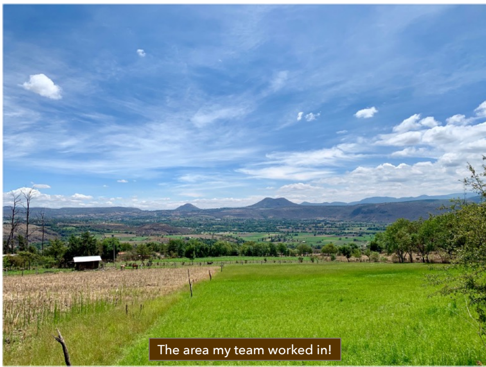
The area my team worked in!

›Dear Lord, once more we pray that your Word would be understood and believed by those who have received it this past week!