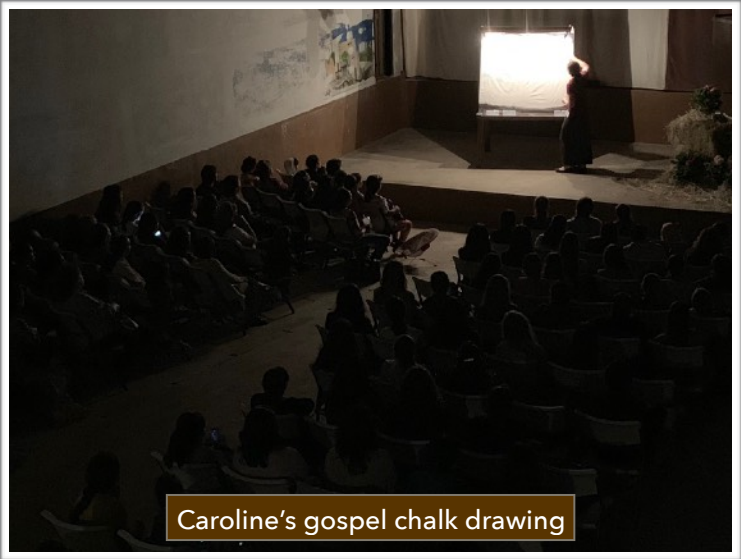
Caroline's gospel chalk drawing