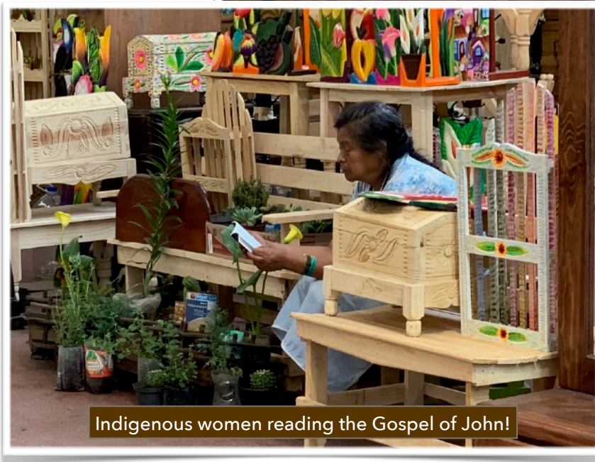
Indigenous women reading the Gospel of John!

› Heavenly Father, cause your Word to be understood and believed by those who have received it at the state fair. › May Your Truth expose the lies of Satan. › We ask that they would receive the love of the Truth! › Let those who trust in You bear much fruit and bring glory to Your name! Amen.