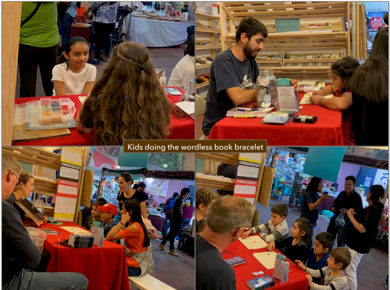
Kids doing the wordless book bracelet