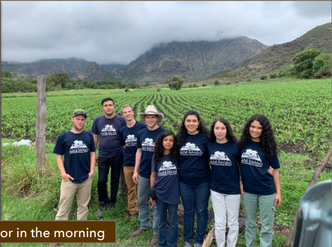
Going door to door in the morning