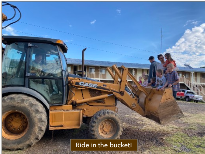
Ride in the bucket!

We usually celebrate Thanksgiving the week after our November family camp. (It rarely falls on the actual Thanksgiving date.) But it doesn't matter! It's our biggest celebration of the year and we enjoy it with all our closest missionary friends and family!