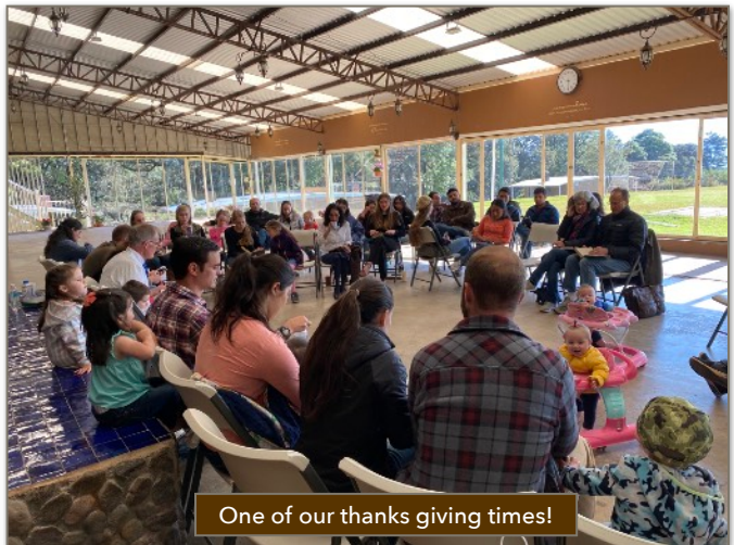
One of our thanks giving times!