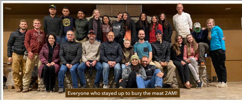
Everyone who stayed up to bury the meat 2AM!