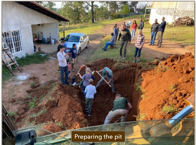
Preparing the pit