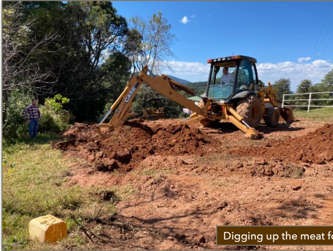
Digging up the meat for our thanksgiving meal