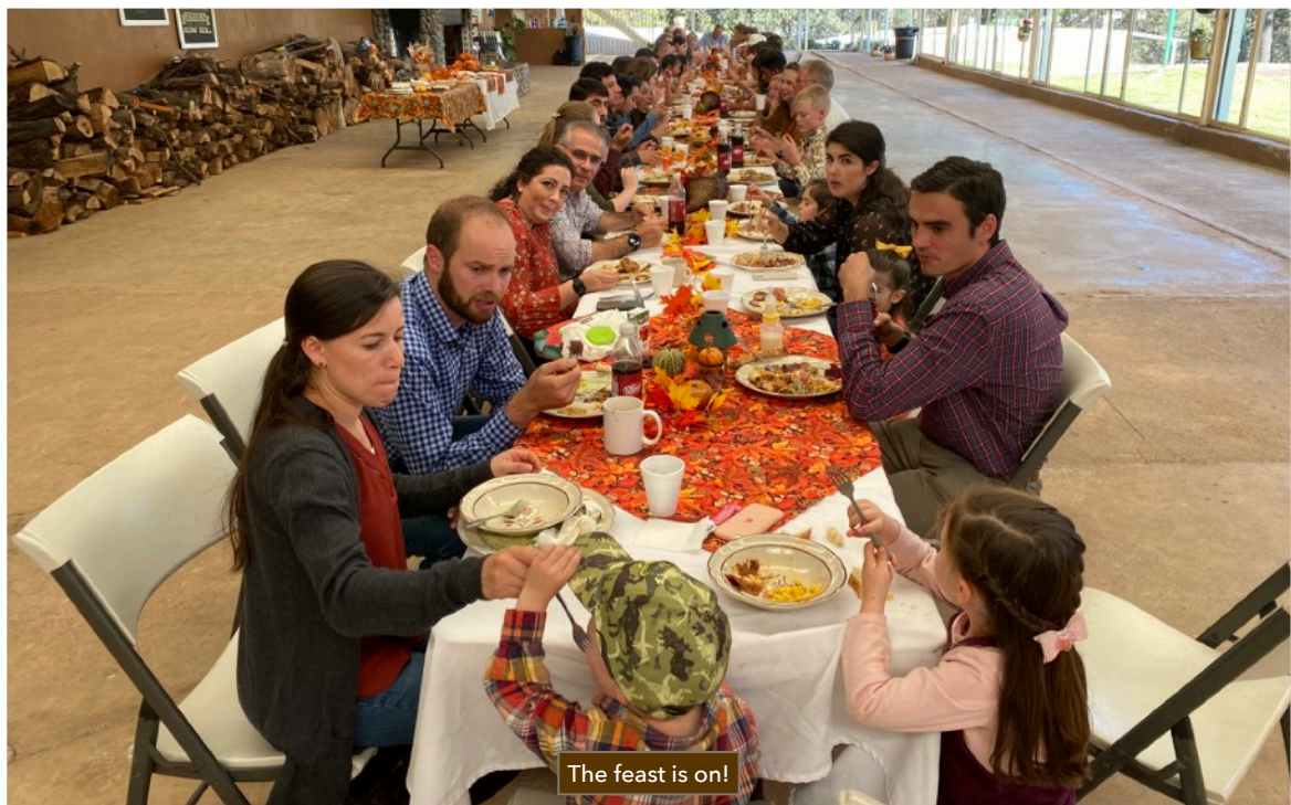
The feast is on!