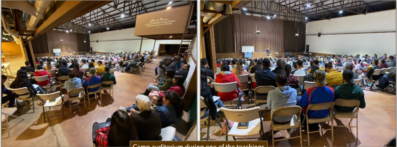
Camp auditorium during one of the teachings