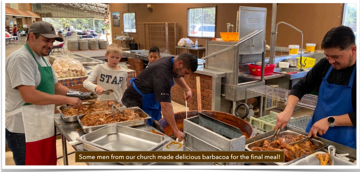
Some men from our church made delicious barbacoa for the final meal!

I didn't take very many pictures during this camp. Sorry!