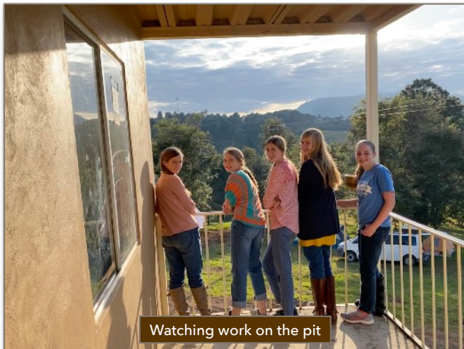
Watching work on the pit