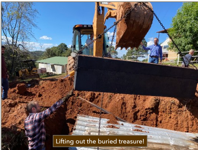
Lifting out the buried treasure!