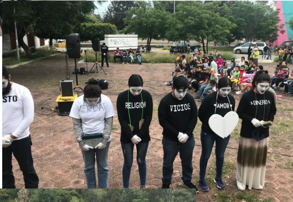
Mime presentation at a park