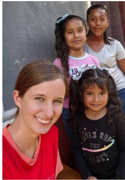
One of the highlights of the young adult camp was doing VBS clubs in 4 surrounding villages. Our campers loved it, and the children loved it!