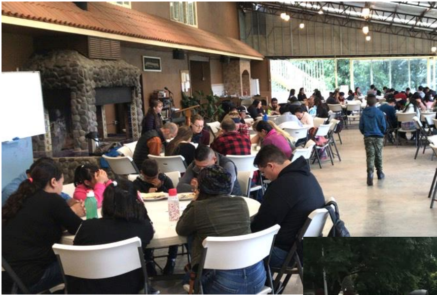
Prayer time following meals.