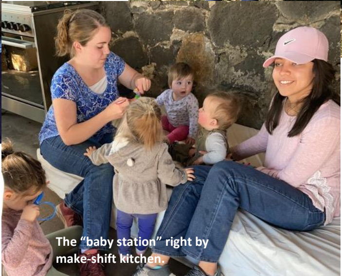
The "baby station" right by make-shift kitchen.

For some of our early breakfast preparations, it was in the 30's with the wind blowing! We felt like icicles!