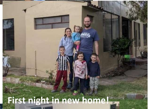
First night in new home!