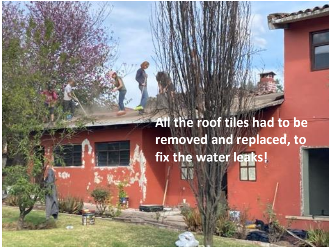
All the roof tiles had to be removed and replaced, to fix the water leaks!