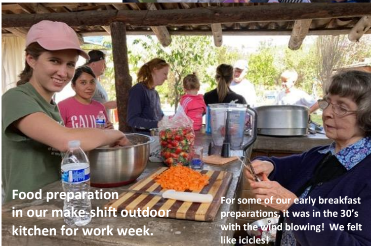
Food preparation in our make-shift outdoor kitchen for work week.

For some of our early breakfast preparations, it was in the 30's with the wind blowing! We felt like icicles!