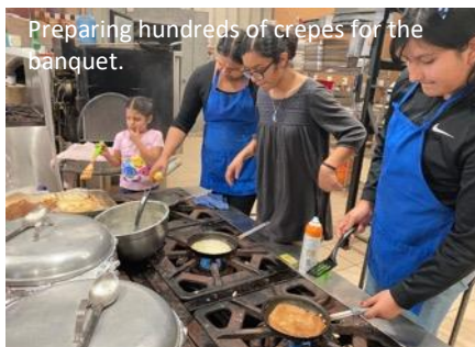
Preparing hundreds of crepes for the banquet.