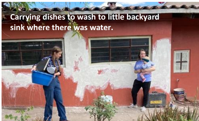
Carrying dishes to wash to little backyard sink where there was water.