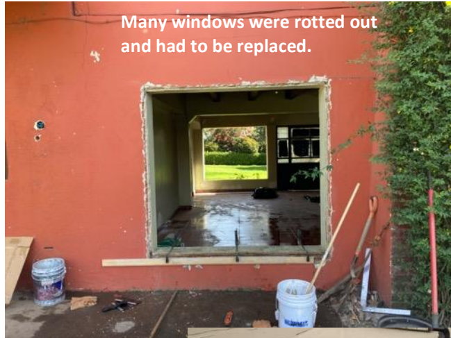
Many windows were rotted out and had to be replaced.