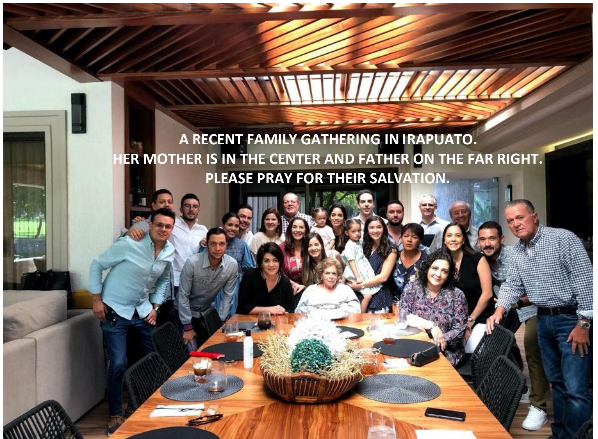
A RECENT FAMILY GATHERING IN IRAPUATO. HER MOTHER IS IN THE CENTER AND FATHER ON THE FAR RIGHT. PLEASE PRAY FOR THEIR SALVATION.