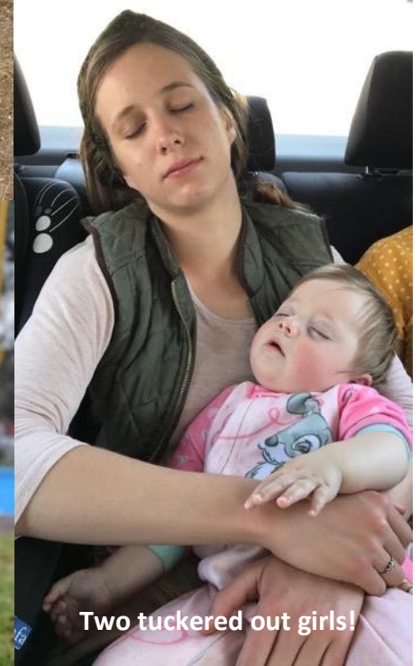
Two tuckered out girls!