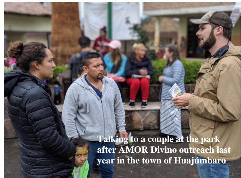
Talking to a couple at the park after AMOR Divino outreach last year in the town of Huajúmbaro