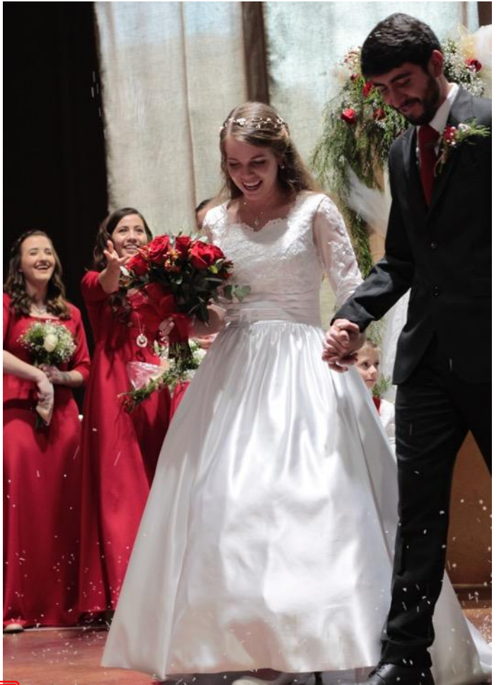
Bride and Groom's nephews, entering mid-ceremony with rings and vows.